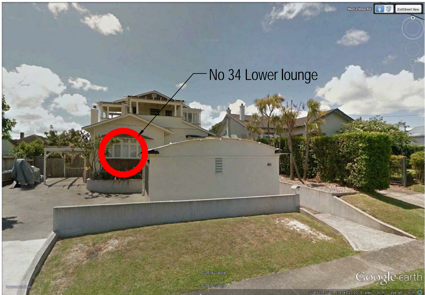
34 Ngataringa Rd - LOWER (LOUNGE)

A1 sheet scale = 1 : 400 A3 sheet scale is twice scale shown above