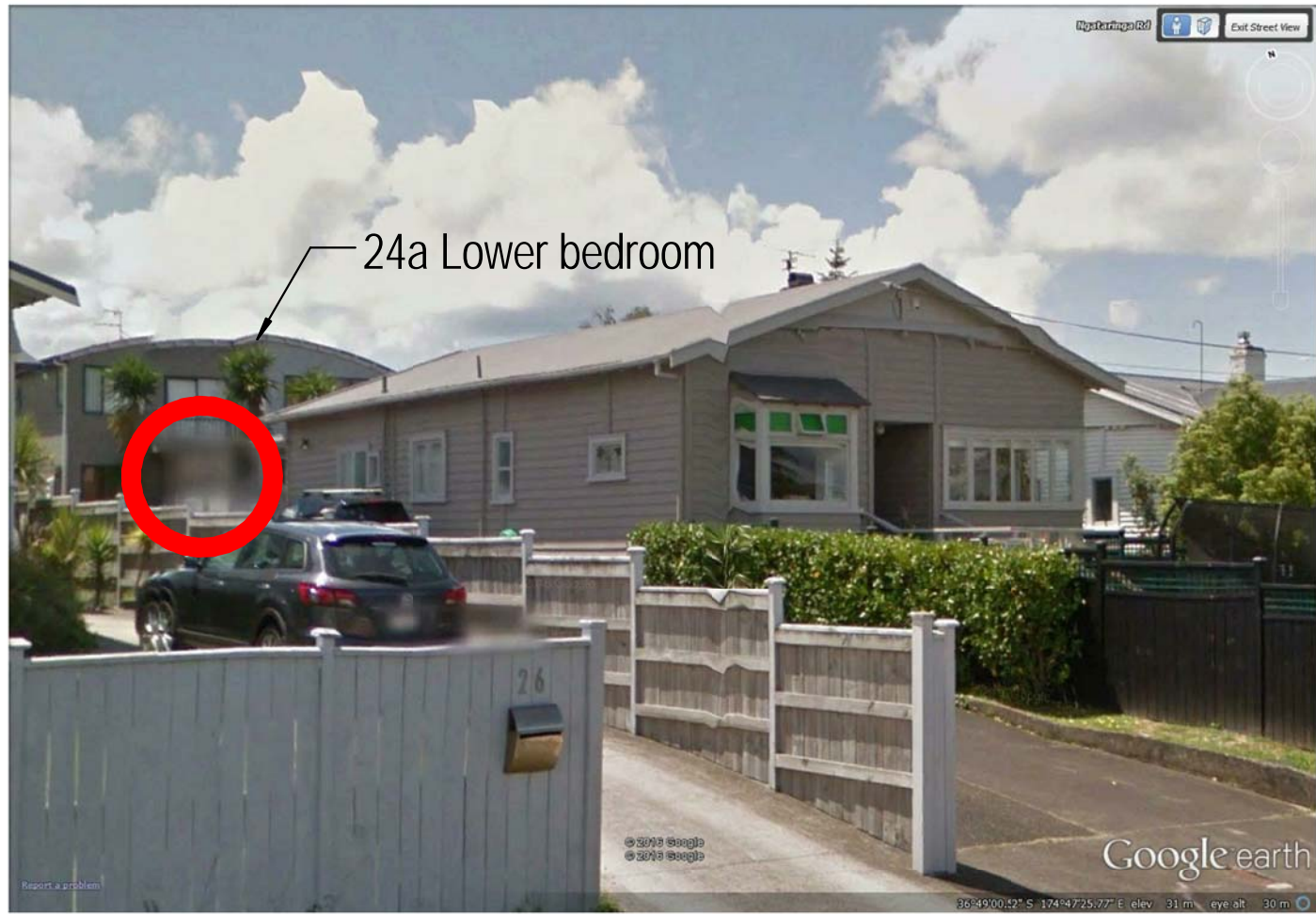
24A Ngataranga Rd - LOWER (BEDROOM)

A1 sheet scale = 1 : 400 A3 sheet scale is twice scale shown above