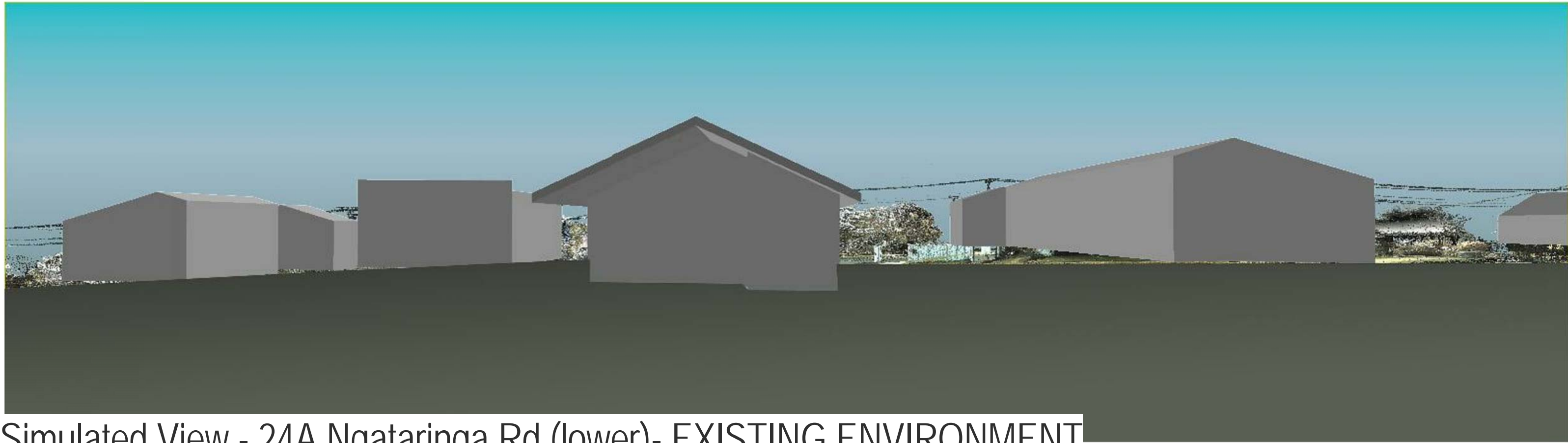
Simulated View - 24A Ngataranga Rd (lower)- EXISTING ENVIRONMENT