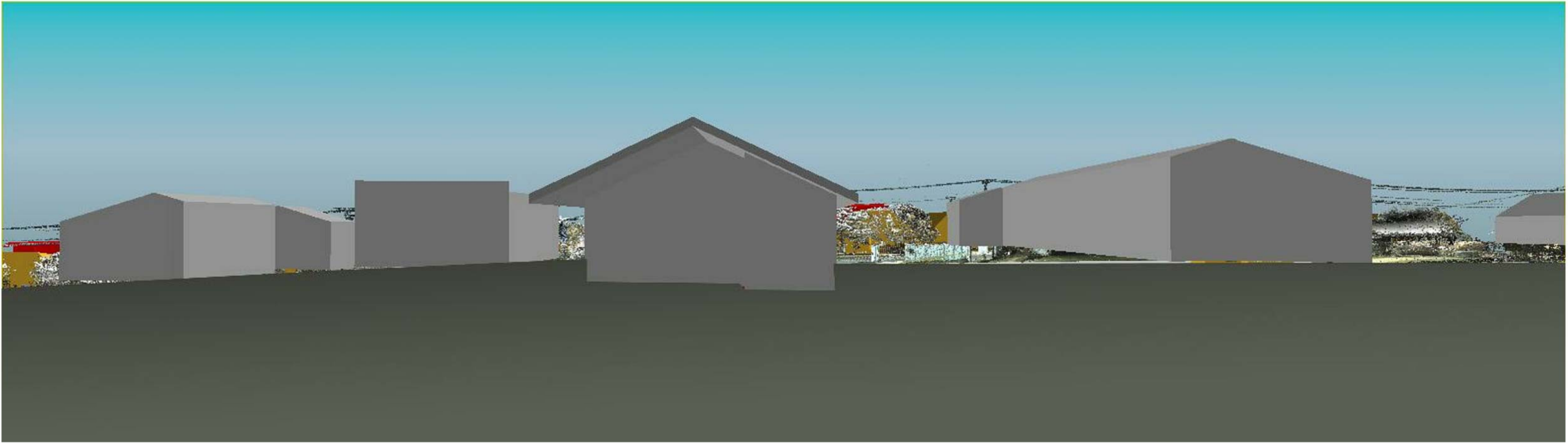
Simulated View - 24A Ngataranga Rd (lower)- COMBINED PERMITTED AND PROPOSED