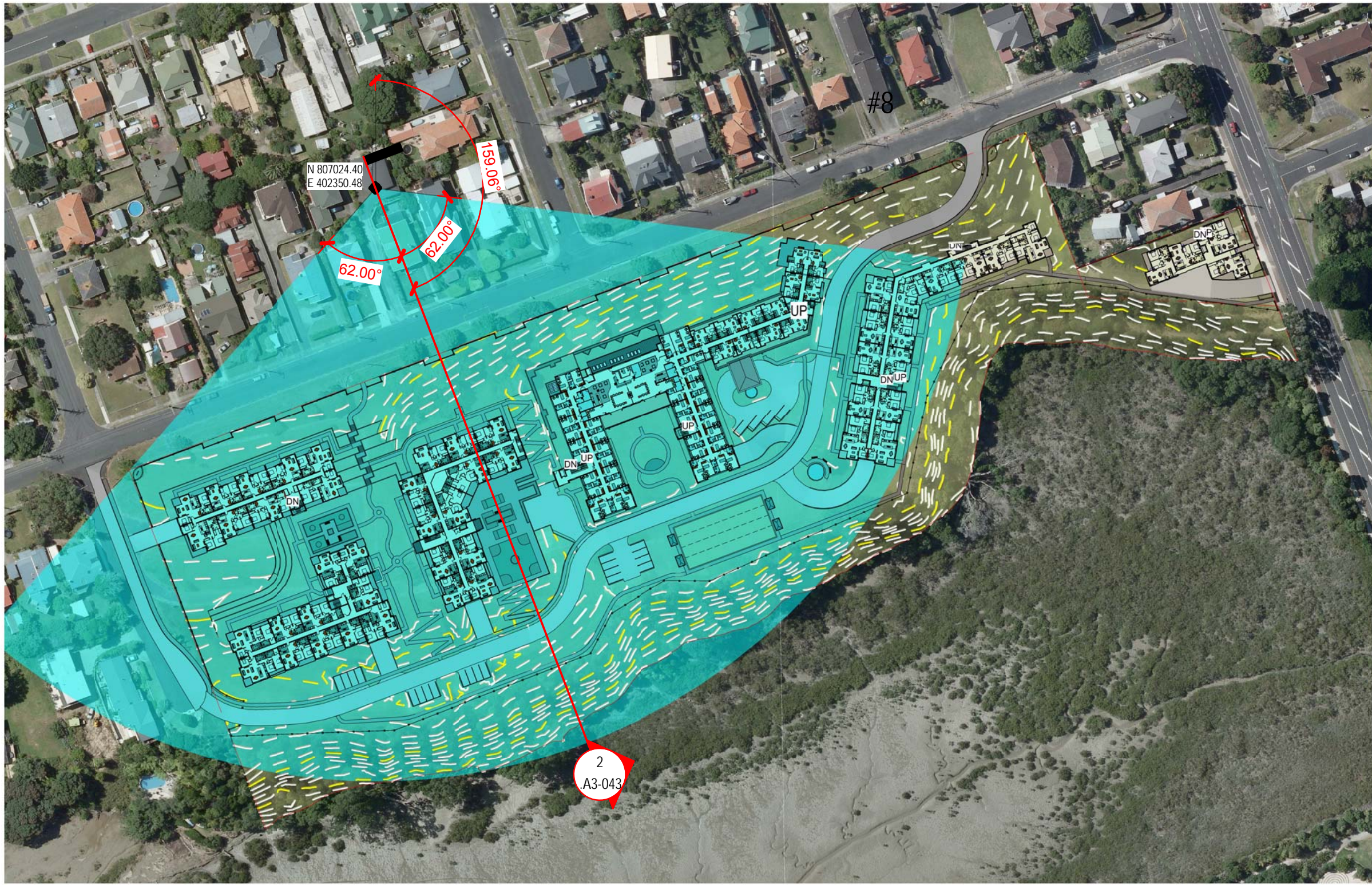
1 Site Plan -Simulated View-24A Ngataringa Rd (upper)

A1 sheet scale = 1 : 1500 A3 sheet scale is twice scale shown above