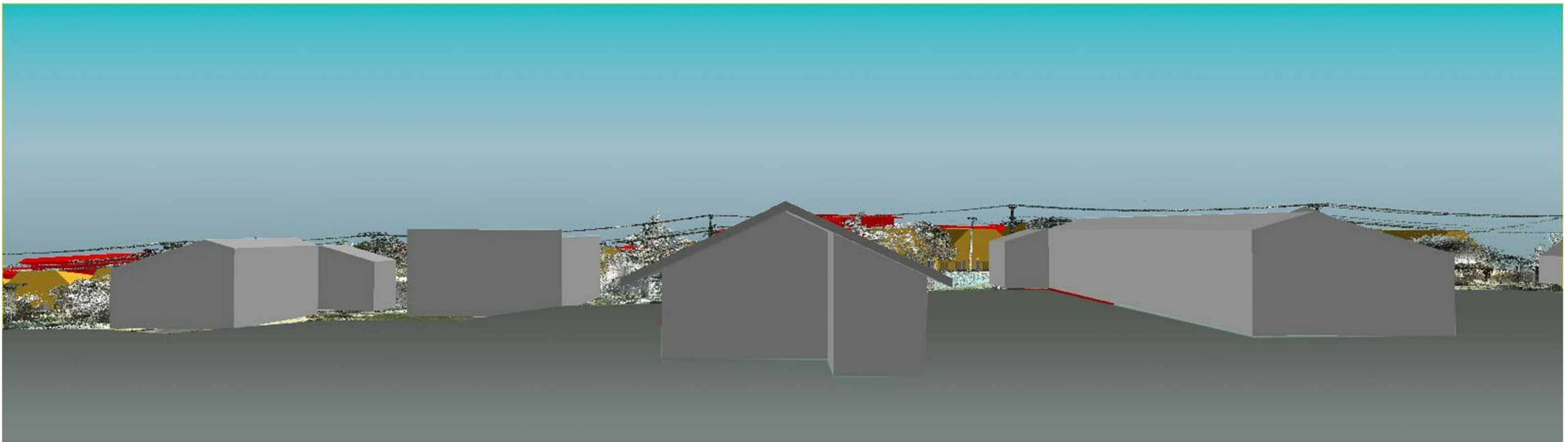
Simulated View - 24A Ngataringa Rd (upper)- COMBINED PERMITTED AND PROPOSED