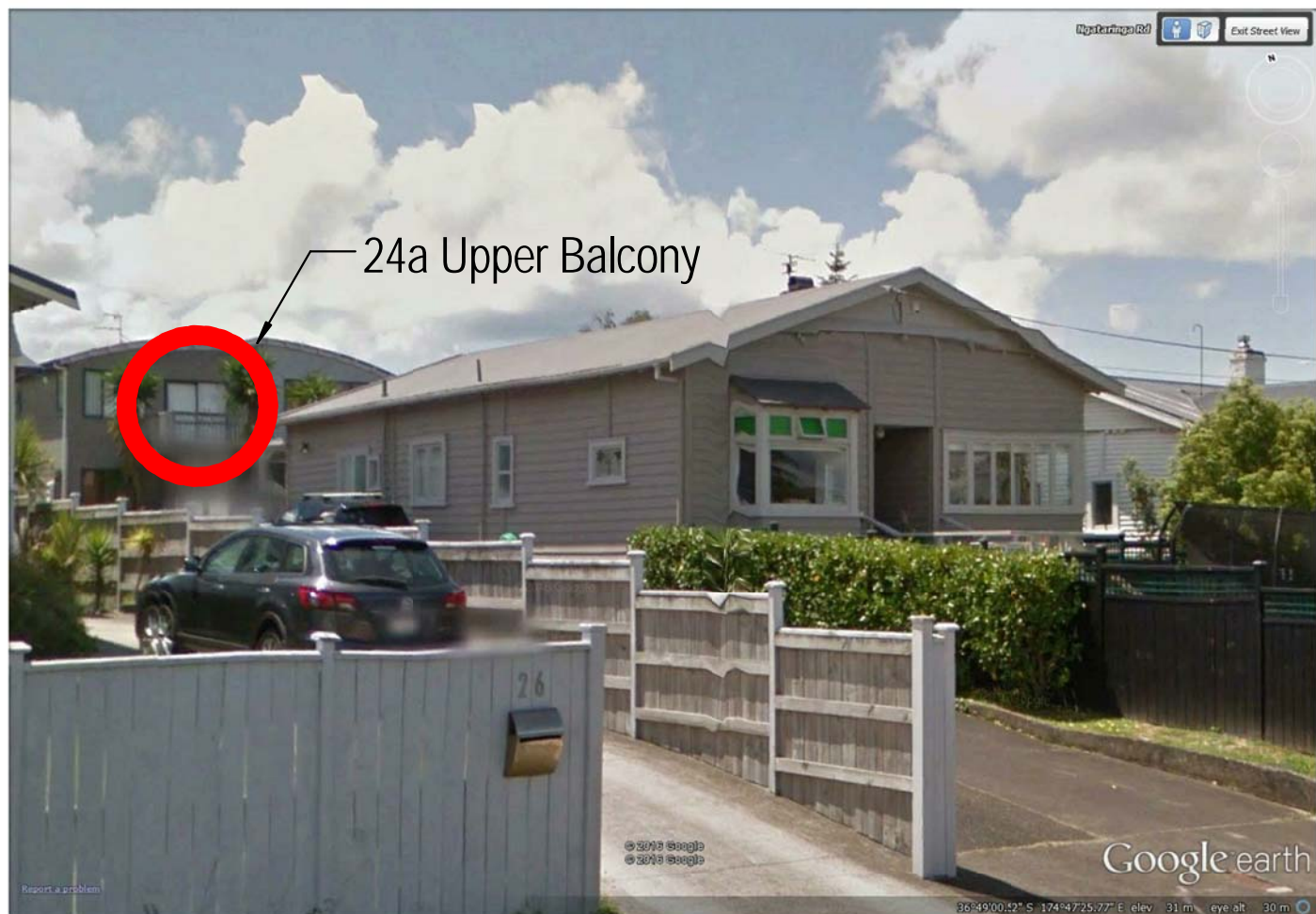
24A Ngataringa Rd - UPPER (BALCONY)

A1 sheet scale = 1 : 400 A3 sheet scale is twice scale shown above