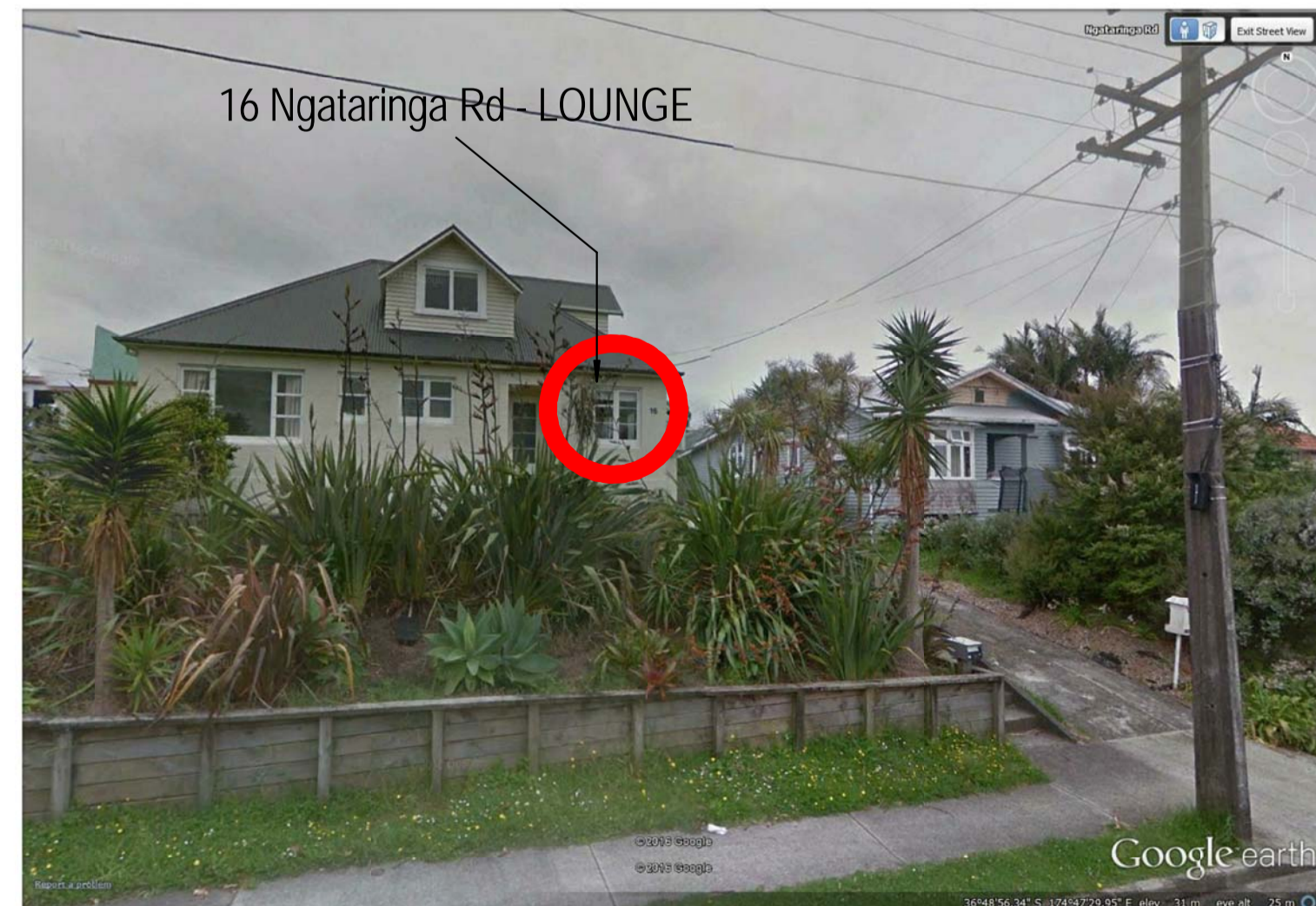
16 Ngataringa Rd - LOUNGE