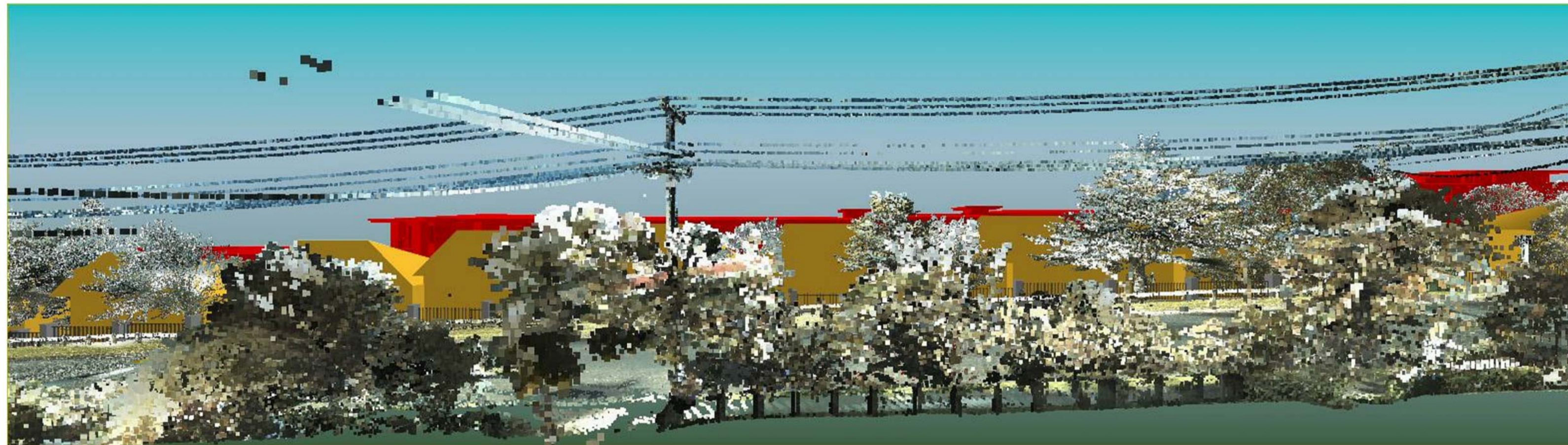
Simulated View - 16 Ngataringa Rd - COMBINED PERMITTED AND PROPOSED