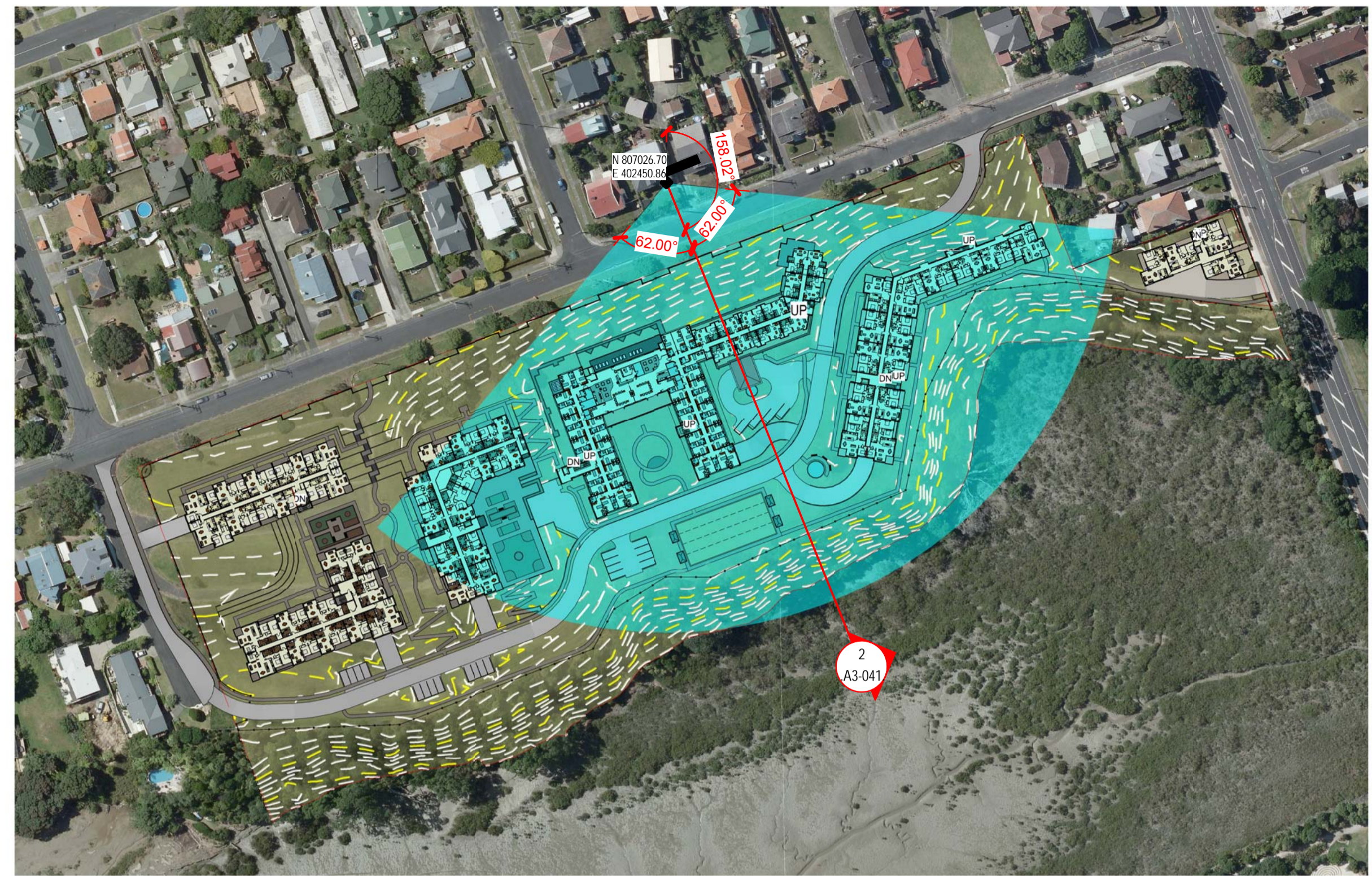
1 Site Plan - Simulated View-16 Ngataringa Rd A1 sheet scale = 1 : 1500 A3 sheet scale is twice scale shown above