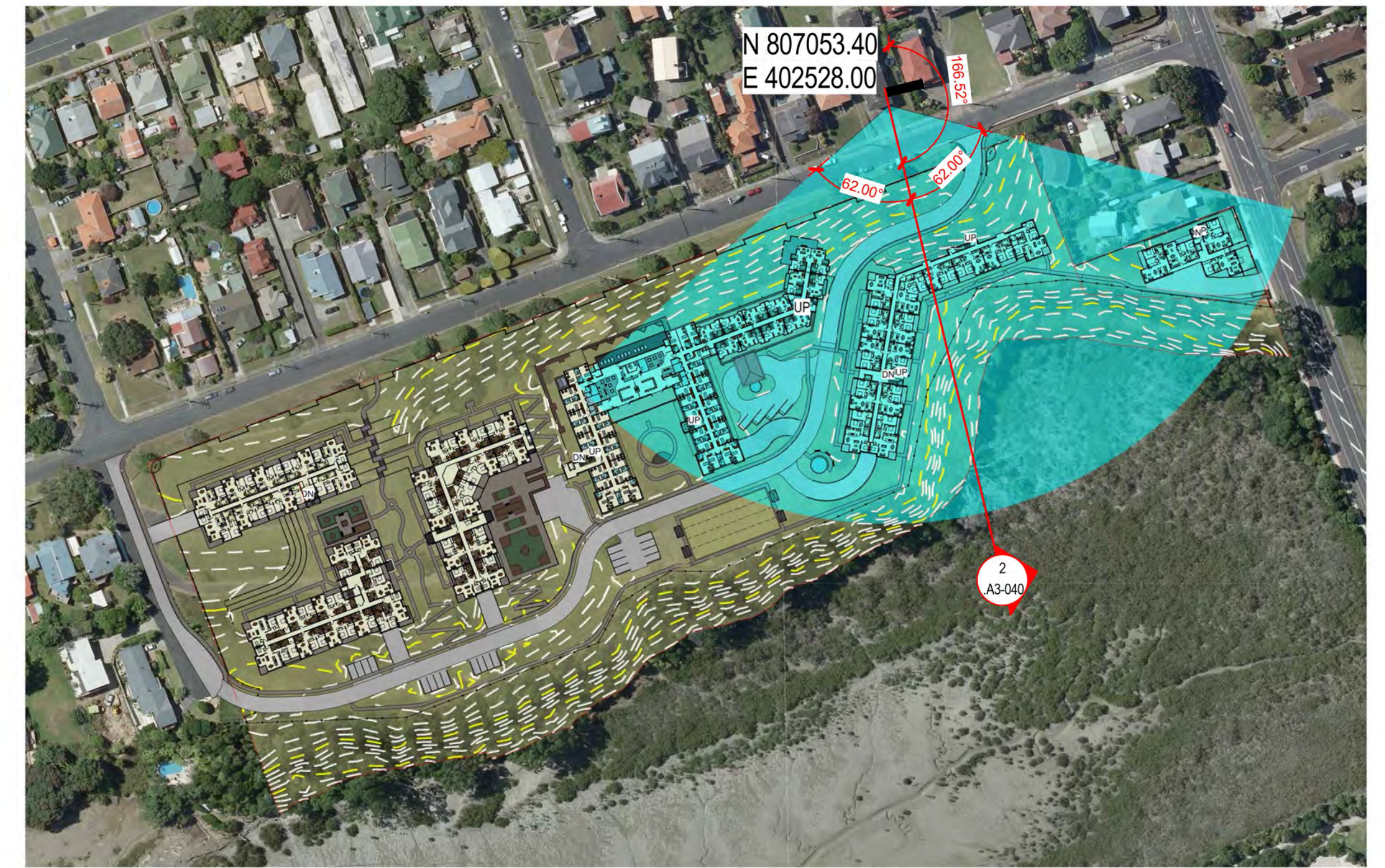
1 Site Plan - Simulated View-8 Ngataranga Rd

A1 sheet scale = 1 : 1500 A3 sheet scale is twice scale shown above