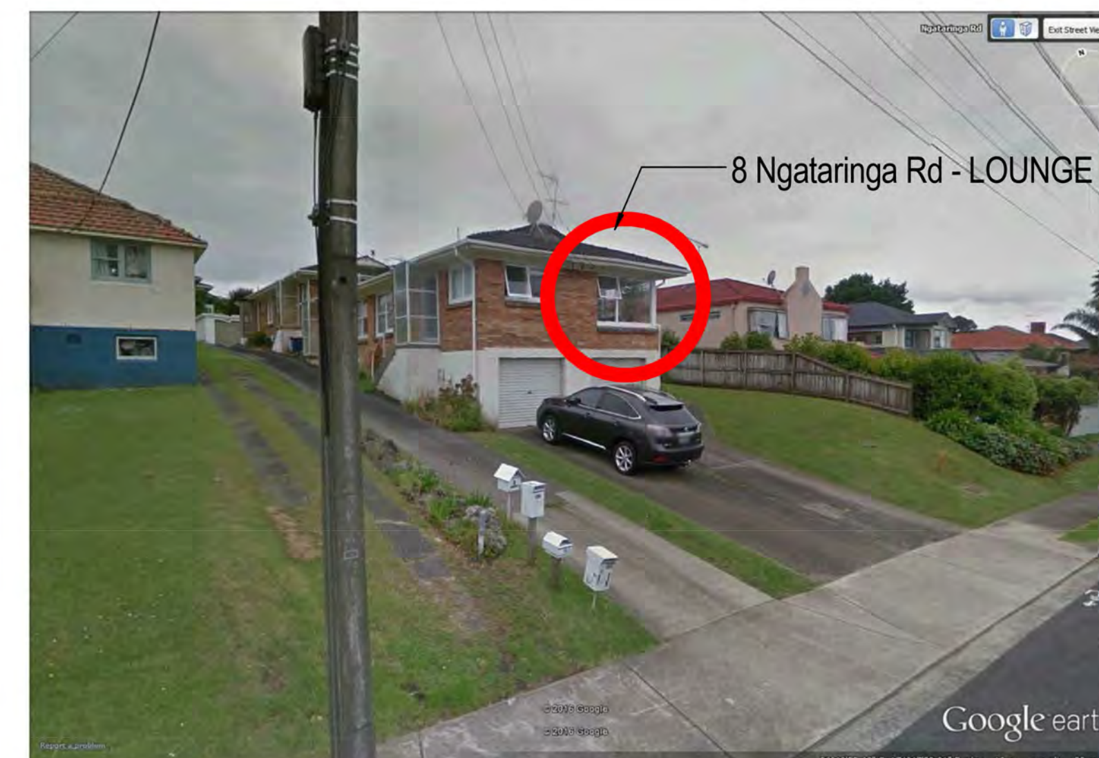
8 Ngataranga Rd - LOUNGE

A1 sheet scale = 1 : 400 A3 sheet scale is twice scale shown above