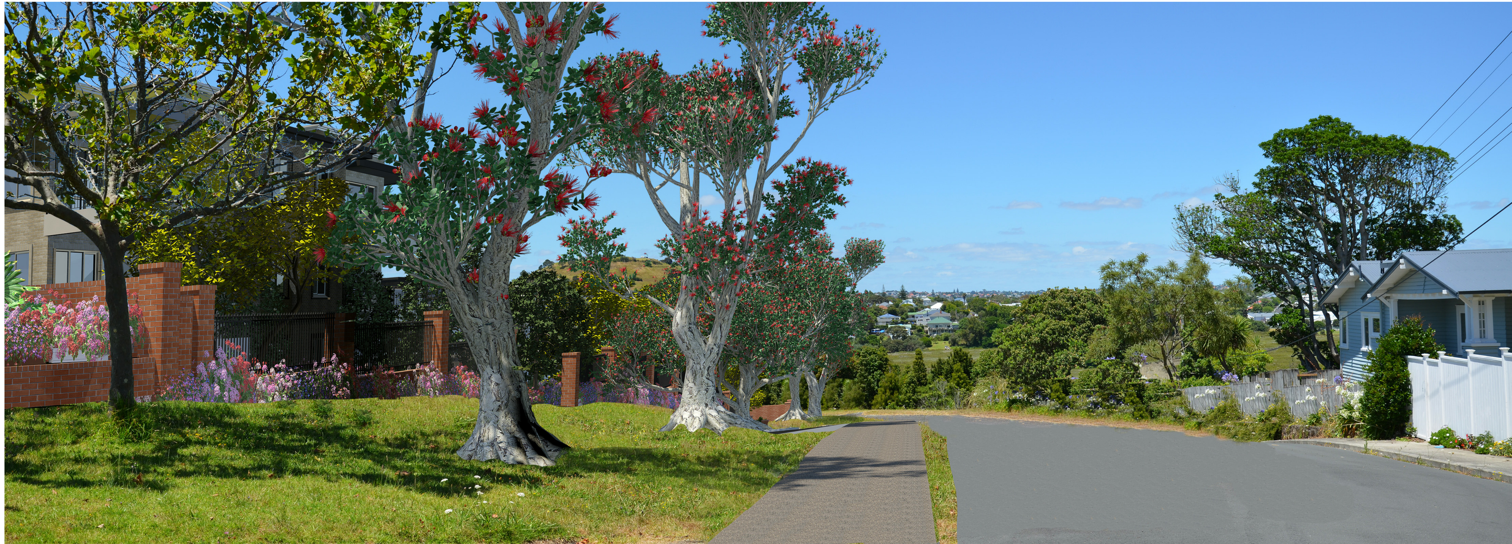
VP14 Wesley Street

B 09.11.15 Final Application Issue A 14.10.15 Resource Consent