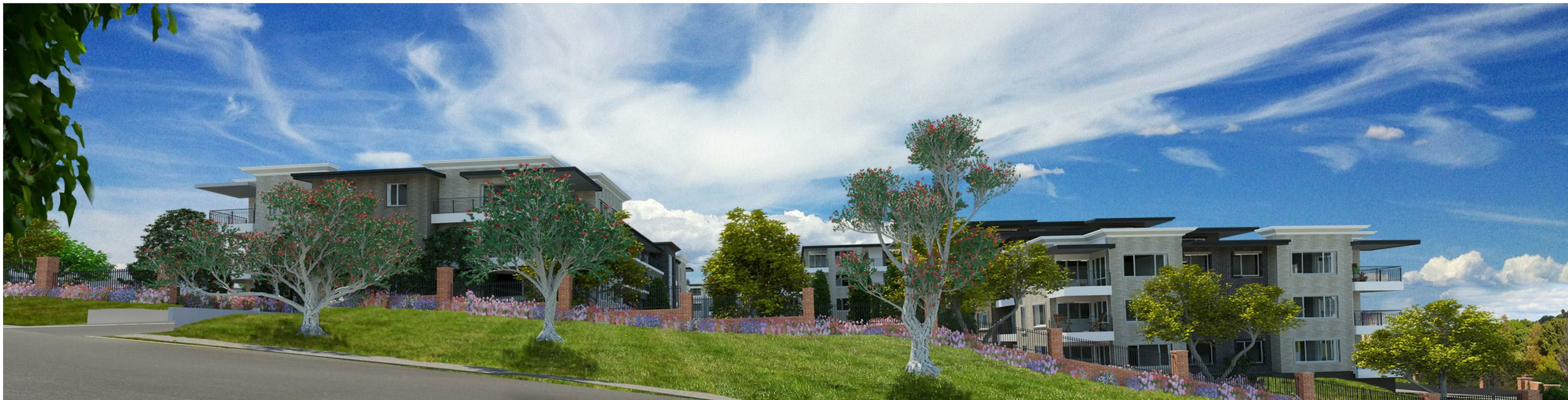
VP15 Wesley Street