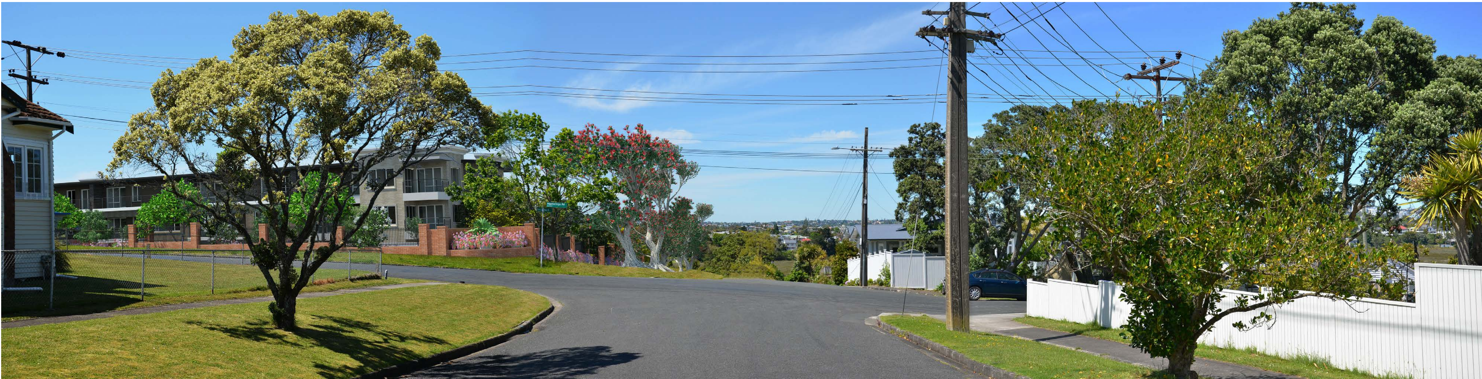
VP13 Wesley Street