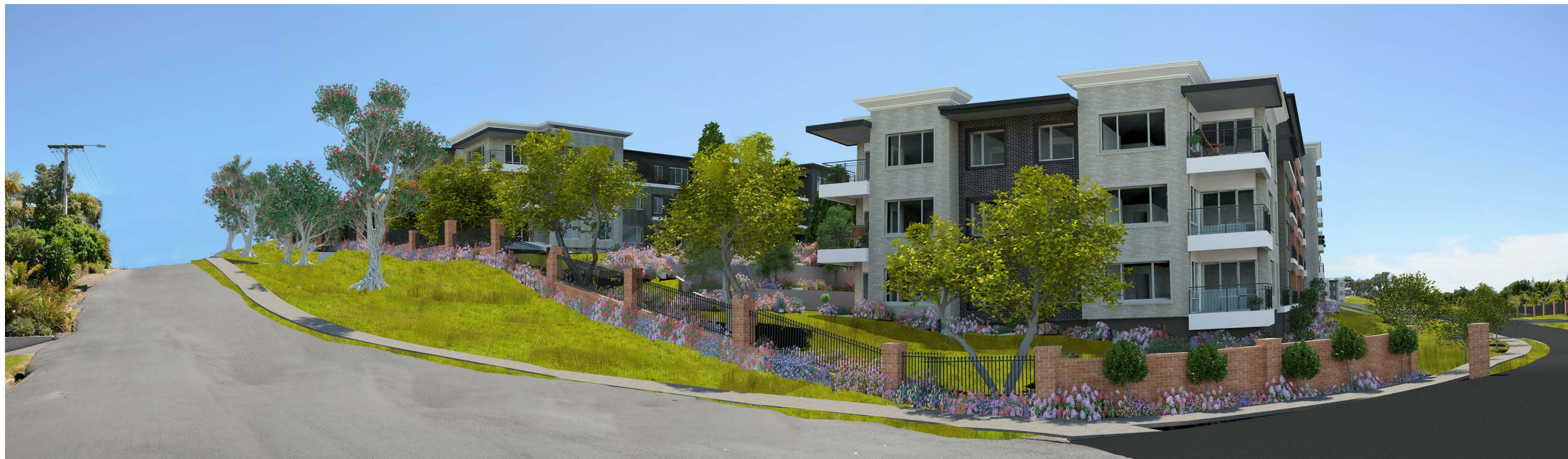
VP16 Wesley Street

B 09.11.15 Final Application Issue A 14.10.15 Resource Consent