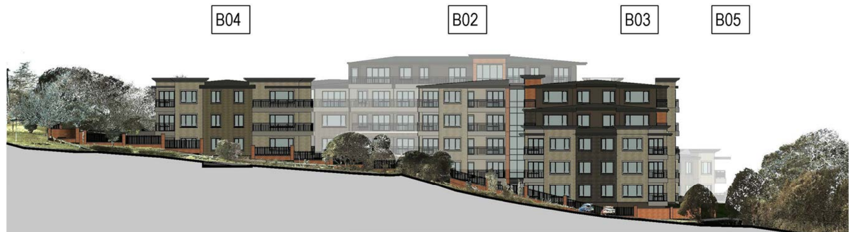
2 Site Elevation - West - Wesley Street A1 sheet scale = 1 : 500 A3 sheet scale is twice scale shown above