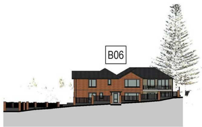
4 Site Elevation - East - Lake Road A1 sheet scale = 1 : 500 A3 sheet scale is twice scale shown above

B 09.11.15 Final Application Issue A 14.10.15 Resource Consent