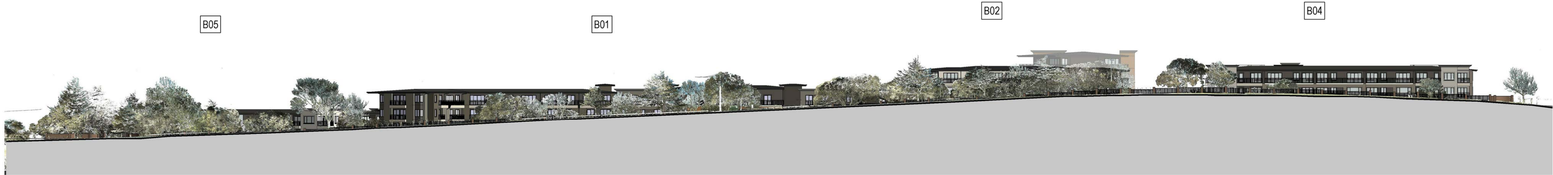
1 Site Elevation - North - Ngataringa Road A1 sheet scale = 1 : 500 A3 sheet scale is twice scale shown above

9/11/2015 2:43:39 p.m. C:\Users\saramcounnie\Documents\035-RCT_S01_M-005-Central-R16_saramcounnie.rvt